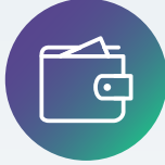
Accounts Payable iBoT