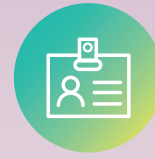
ID Management iBoT