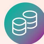
Data Clearance iBoT