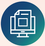
Data Entry iBoT