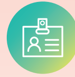
ID Management iBoT