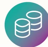
Data Clearance iBoT