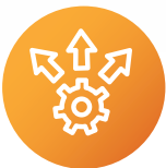
SFDC CRM iBoT