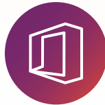
Office 365 iBoT