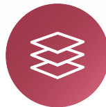
Sugar CRM iBoT