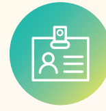
ID Management iBoT