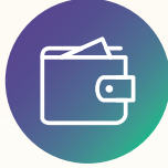
Accounts Payable iBoT